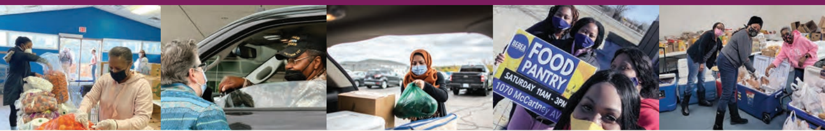
Food Gatherers' partner programs distribute food throughout Washtenaw County. Pictured here: Community Action Network, VA Healthcare System, Jewish Family Services, Berea Cares, Progressive Ministry Baptist Church.

Federal food assistance programs were critical during the pandemic and we need to sustain these supports to build a food secure future. Please join food banks across the country advocating to keep existing supports and secure additional investments. Check out our advocacy corner inside this newsletter to learn more about our policy priorities or visit foodgatherers.org/advocate.