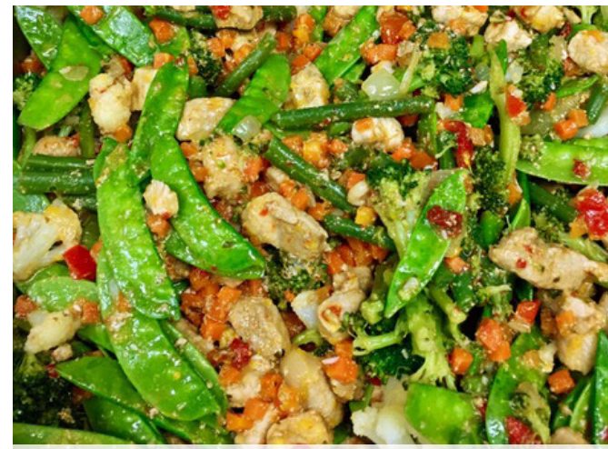
Pork stir fry created almost entirely from rescued food and served in the Food Gatherers Community Kitchen in the Delonis Center.

Six days a week you can see our seven trucks out on the roads of Washtenaw County! They leave our warehouse filled with food deliveries to our 170 community partners and programs, and they return with edible food collected from local businesses who can't sell it. At our warehouse, Food Gatherers' volunteers inspect and sort the rescued food to ensure it is safe and healthy, and then it is delivered to partner food pantries, grocery distributions, and meal programs, sometimes all on the same day.