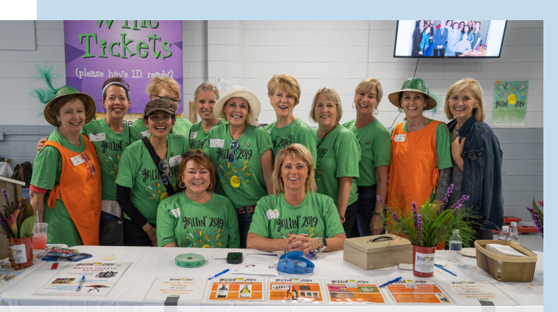
Delta Air Lines employees volunteered together at Grillin' to fight hunger where they live.

The 30th annual Grillin' for Food Gatherers was a success, raising more than 700,000 meals for our hungry neighbors! Despite the rain, we had a great turnout of both Grillin' regulars and newcomers, and everybody was treated to delicious food donated by local businesses, sweet desserts from Zingerman's Bakehouse and Creamery, and live tunes.