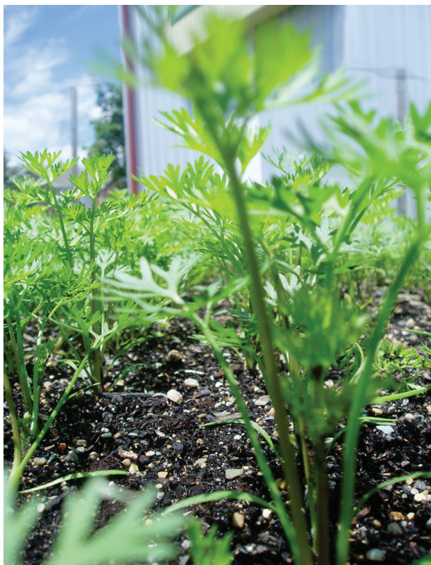
GATHERING FARM SEEDLINGS GROWING AT MATTHAEI BOTANICAL GARDENS