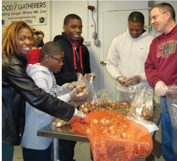
VOLUNTEERS SORT AND PACKAGE ONIONS AS PART OF FAMILY VOLUNTEER DAY

VOLUNTEERS ARE VITAL TO FOOD GATHERERS' SUCCESS!