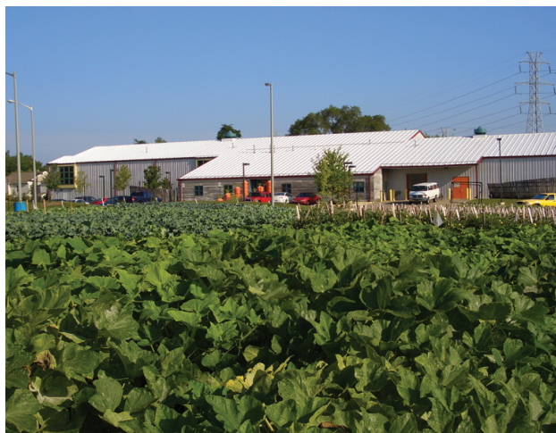
WINTER SQUASH, BROCCOLI, COLLARDS AND TOMATOES GROWING ON THE GATHERING FARM.

Food Gatherers' Food Security Report , funded by the United Way of Washtenaw County, The Ann Arbor Area Community Foundation and the James A. & Faith Knight Foundation, indicated that cost (not preference, not access) is the single biggest barrier to healthy eating. With additional funding secured from Ann Arbor Community Foundation's "Big Idea" grant we planted the seeds to connect more low-income individuals and families to healthy food.