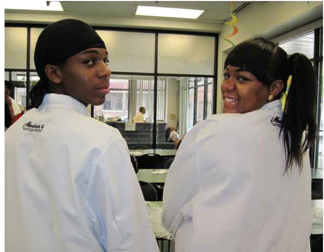
TRAINING PROGRAM STUDENTS RECEIVE A GOLDEN SPOON AWARD AND OFFICIAL CHEF JACKET, GENEROUSLY DONATED BY MAURER’S, AT GRADUATION.

Food Gatherers supported five Summer Food Programs at local community centers during the summer of 2010; the programs served 3,500 nutritious meals to 200 children who might otherwise have gone hungry. The Summer Food Program was created to fill the gap in the summer months when low-income children do not have access to free or reduced meals through their schools. Children at many sites receive classes in nutrition education designed and taught by Food Gatherers’ interns from the University of Michigan School of Public Health.